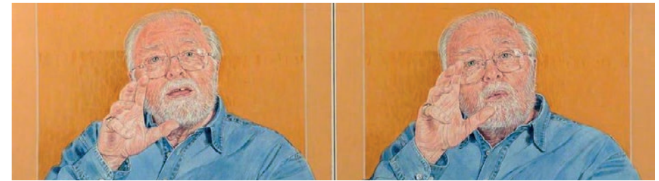
Portrait of Richard Attenborough which hangs in RADA reception. By Bryan Organ