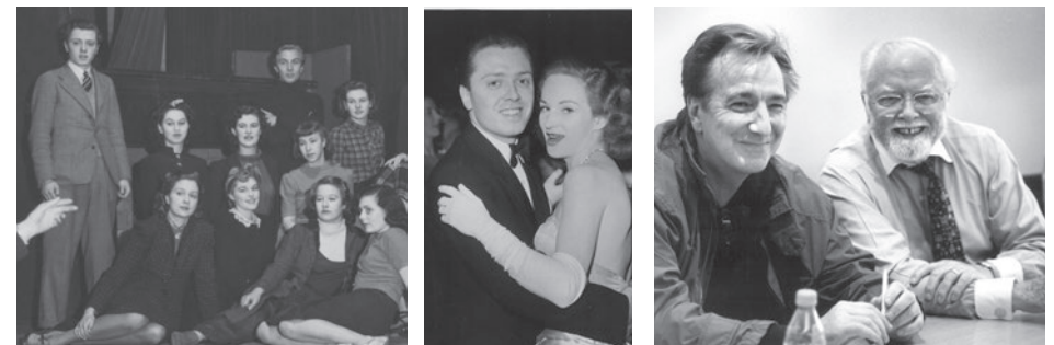
Left: Richard Attenborough training at RADA; middle: Richard Attenborough and Joan Greenwood at a fundraising ball for rebuilding the RADA theatre after the war; right: Richard Attenborough at a Council Meeting with Alan Rickman.